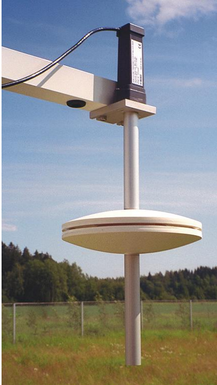
SPH10/20 is easy to install and connect. In the picture, SPH10 is connected to PTB210.

SPH10 and SPH20 are a perfect pair for all Vaisala barometers. They ensure an accurate and reliable measurement in all weather conditions.