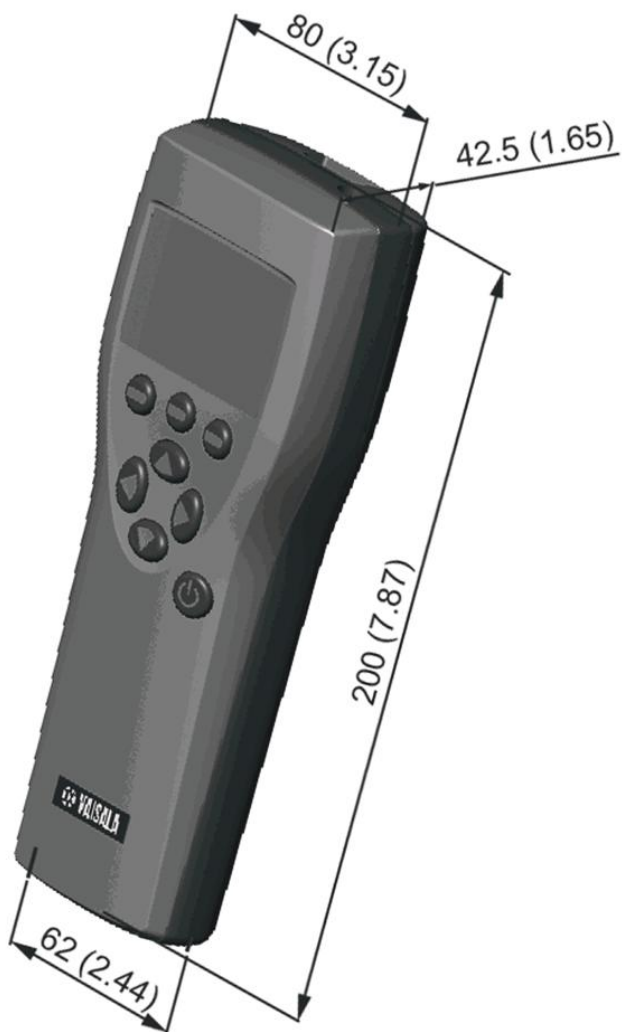
Indicator dimensions in mm (inches)