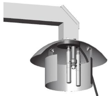
For calibration, a portable HMP77 reference probe is easy to attach beside HMT337 or PTU307 probe.

Obtaining a true humidity reading is particularly important e.g. in traffic safety: at airports and at sea as well as on the roads. It is essential, for example, in fog and frost prediction.