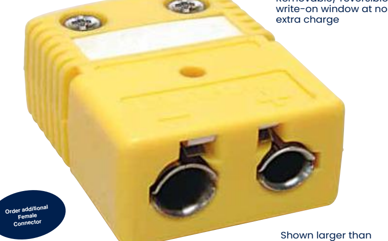
Shown larger than actual size.