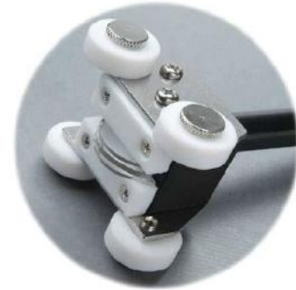
Roller Material: Teflon