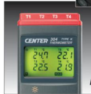
LED Back Light